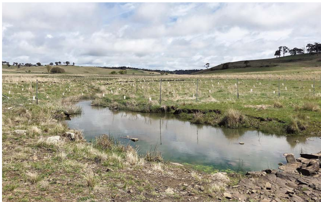
Various techniques along Urandangie Creek are restoring landscape hydration.

The William's family would like to thank Guyra CWA and Guyra Lions Club for their assistance, letting them do practice presentations. The New South Wales Police Force are a major supporter of Special Olympics supplying all the Athletes with their suits, the evening venue and dinner.