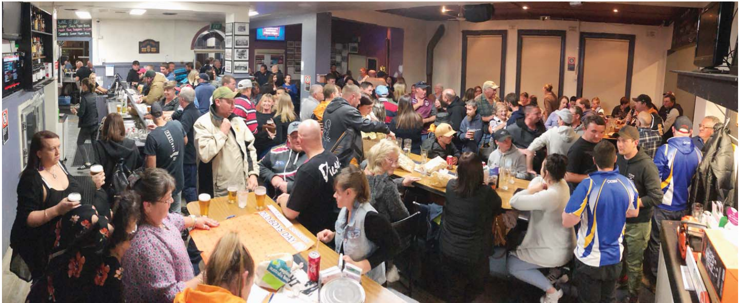
The Royal Hotel was bursting at the seams on Saturday night with a total of $17,100 raised by Guyra United Soccer Club