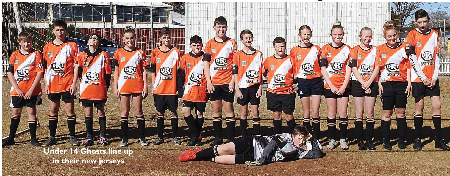
Under 14 Ghosts line up in their new jerseys