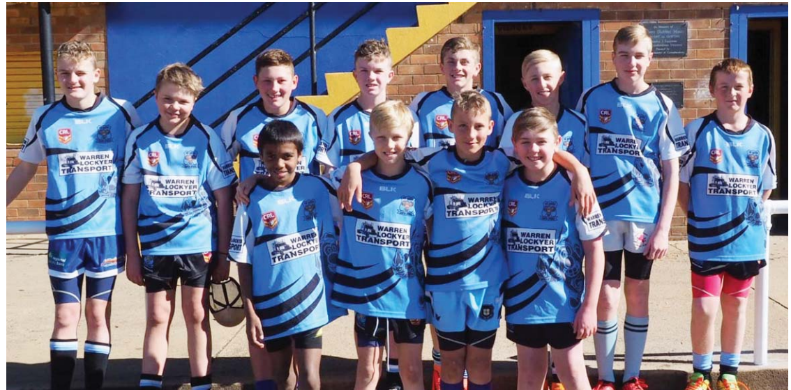
Guyra Central School Under 13s Rugby League team defeated Gulargambone and will compete in the finals of the Country Cup State Championships

Working as a team and with exceptional sportsmanship, the team defeated Gulargambone 54-8 and will now travel