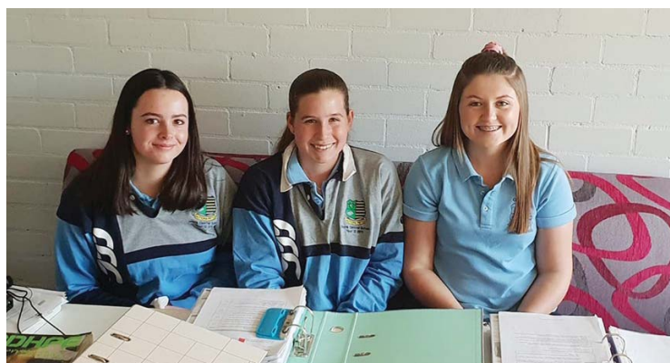
Senior students are enjoying their new study area

The current year 11/12 students spent time with supplier, ABAX Kingfisher, selecting fabrics and designs for the new area. The suppliers were so im-