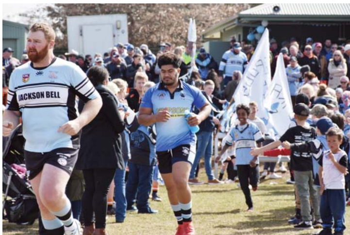
If you want to see the Super Spuds on the field this year now is the time to step up by joining the committee

The Guyra Rugby League Club has been inundated with enquiries from potential players for the 2020 season and could field up to three teams in the Group 19 competition.