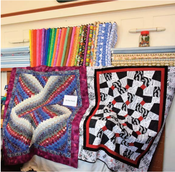
Quilts and art are on display at the RSL Hall in Bradley Street