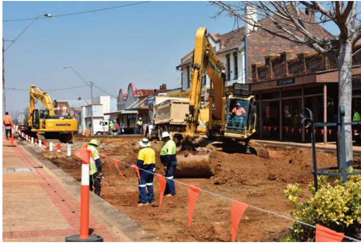
Digging a little deeper has meant that the final resealing of Bradley Street was delayed

"We had hoped to do an initial seal before the weekend but decided to wait allow the