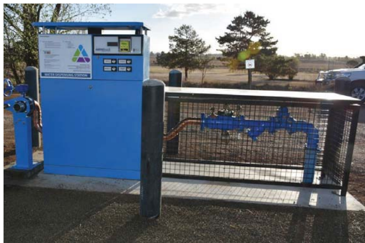
After just a few weeks in operation there will be changes to the way water is dispensed for rural residents

The proposed fees, on public exhibition until November 22nd, include a $100 one-off