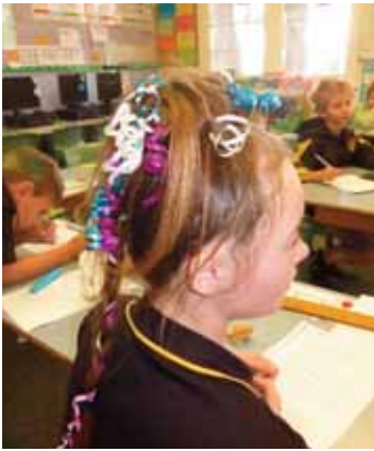
Black Mountain students marked the return to school with a Crazy Hair Day