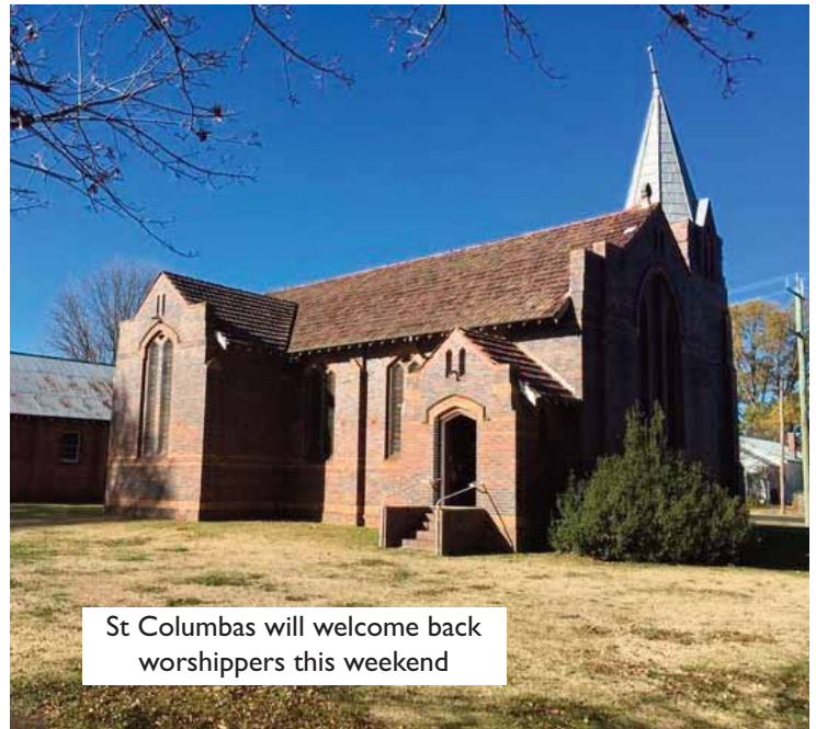
St Columbas will welcome back worshippers this weekend

The Presbyterian community meet each Sunday at 9.00 am, followed by morning tea. All are welcome, though anyone with a sniffle should stay home. CDs of services will still be available for anyone unable to attend.