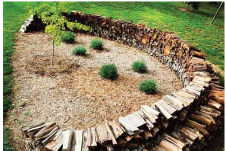
A Woodpile Wall' - what an inspiring idea for a structural element in any garden.

But what really comes into its own at this time of year are the structural elements of your garden, such as hedges, decorative tree trunks, as de-