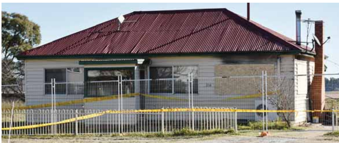
Fire damaged this Falconer street residence last week

The brigade reported that the position was in hand by 9.36 pm with the fire completely extinguished. The fire was not deemed to be suspicious and is believed to have started in a lounge chair. The fire was con-