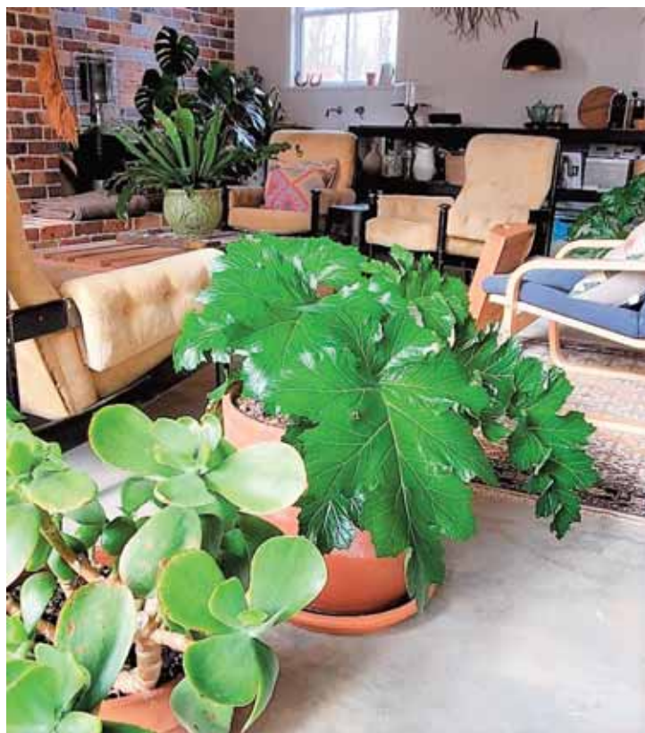
Indoor plants have been proven to lift moods

So what to choose? If you're new to indoor plants I'd steer clear of the Maidenhair Fern, it can be very temperamen-