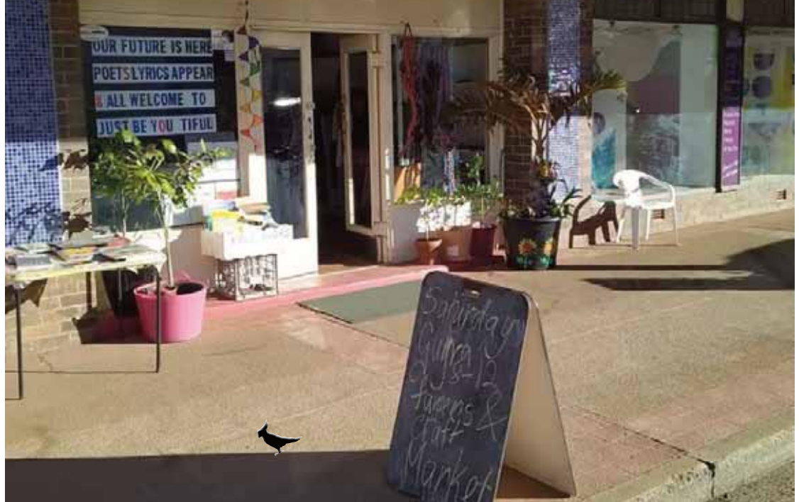
Saturday morning markets at the Australian Poetry Hall of Fame