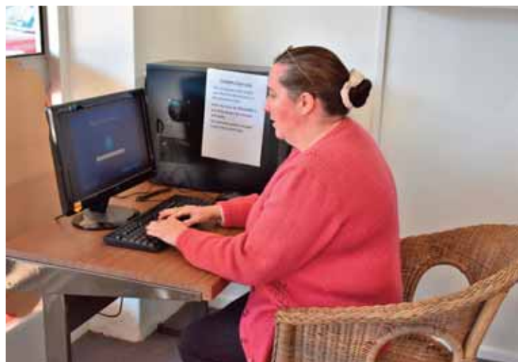
If you need access to a computer, you will find one available for public use in the foyer at GALA. Staff can assist if necessary