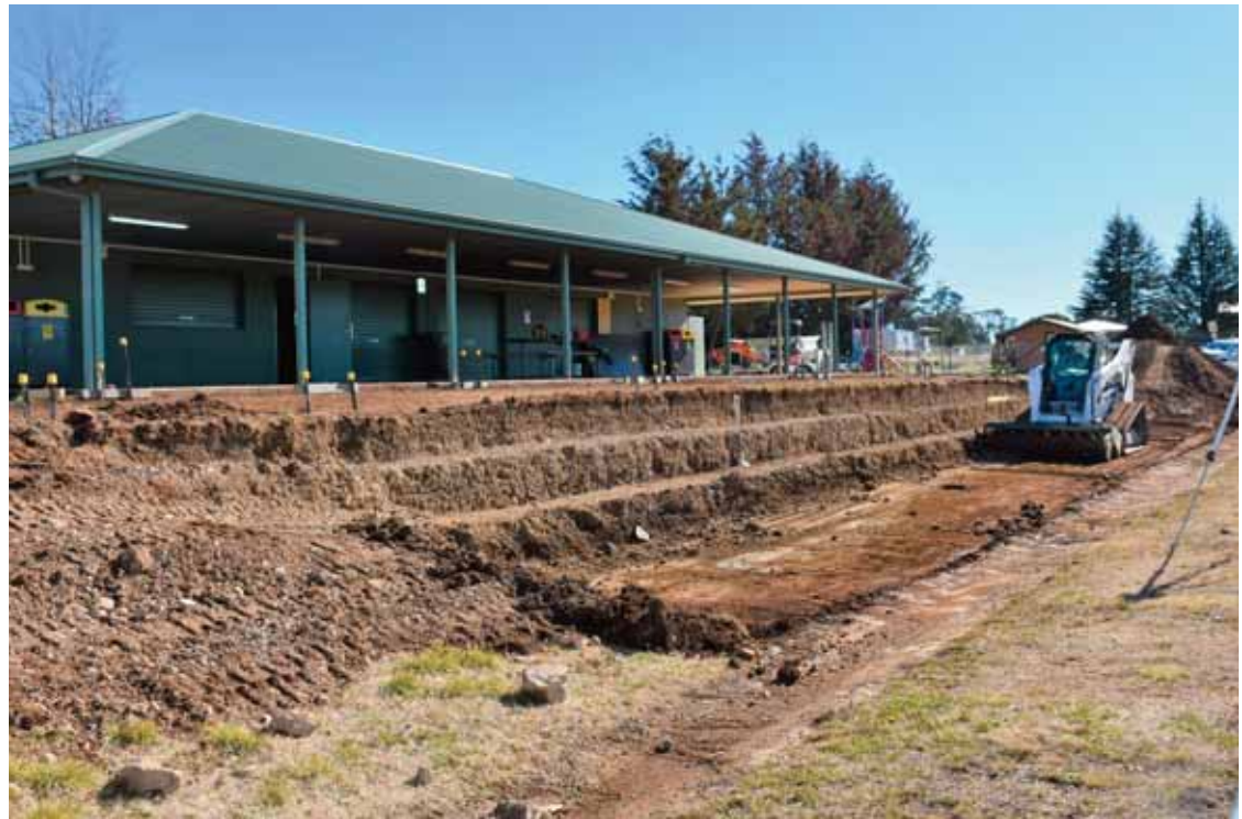
Earthworks were started on Monday of this week

The start of the project comes one week after the club made the difficult decision to withdraw from the