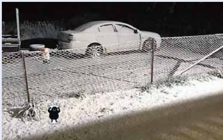
Snow at Ben Lomond on Monday evening

There were reports of around 2 to 4cm of snow settling shortly after dark at Ben Lomond. Most of the snow fell between 6pm and 7pm and further falls predicted for Tuesday did not eventuate.