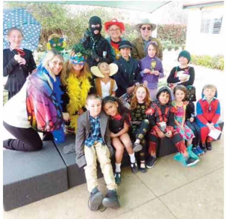
Black Mountain Public School students enjoyed dressing up as their favourite book character for Book Week