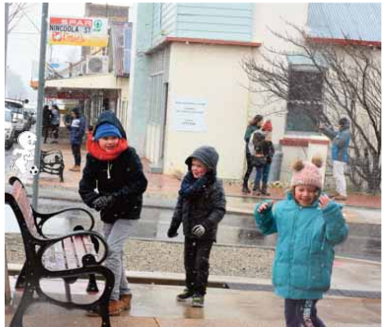
Visitors to Guyra on Saturday were rewarded with a brief but welcome fall of snow around mdday.