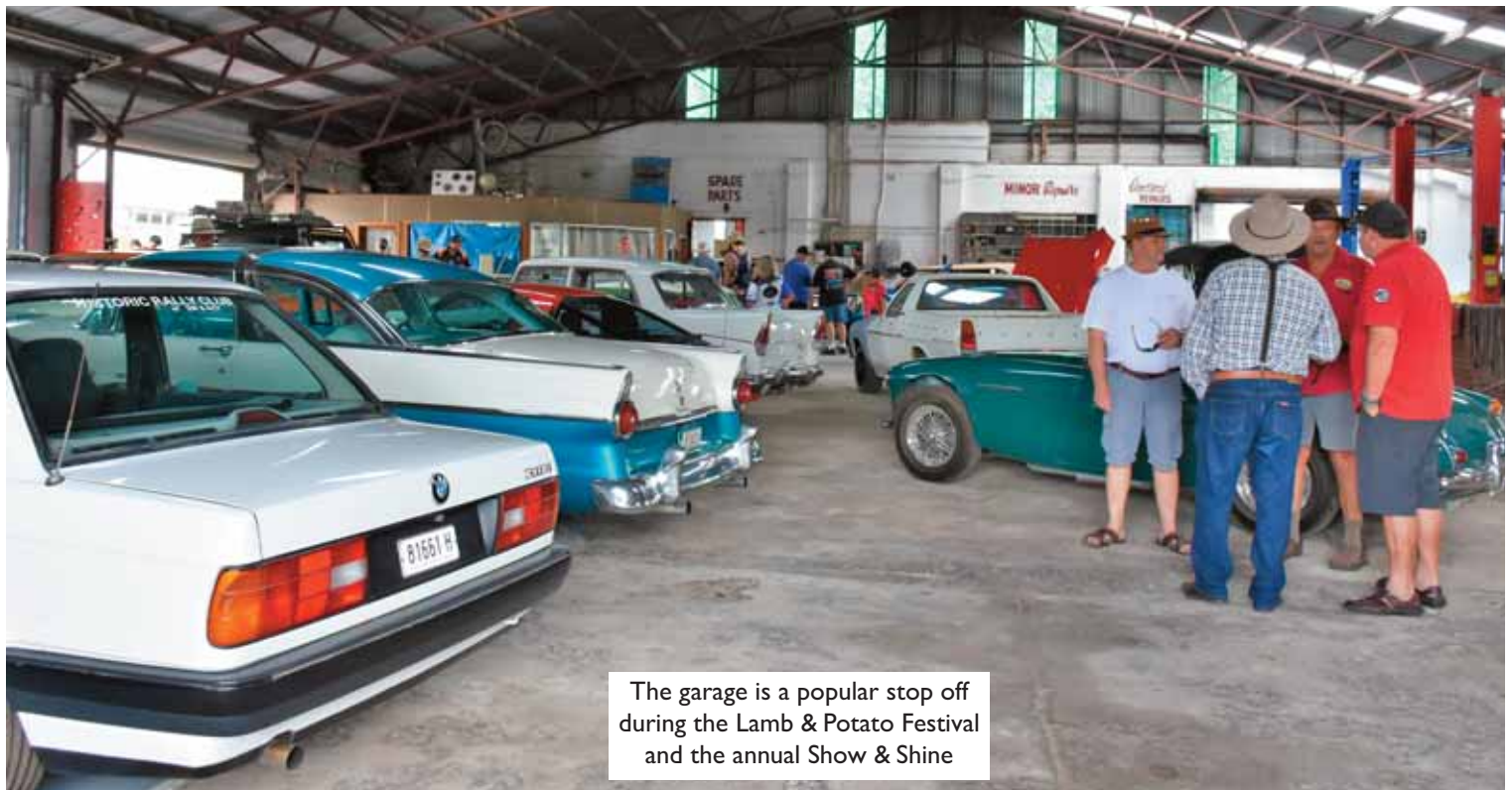
The garage is a popular stop off during the Lamb & Potato Festival and the annual Show & Shine

Guyra is a great town, we have enjoyed becoming part of the community. We are really pleased and surprised by where our visitors have come from.