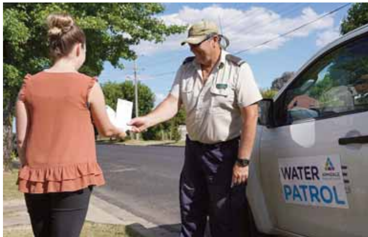
Council Water Patrols will again encourage residents to adhere to level 3 water restrictions.

"I am urging residents to put to good use the water