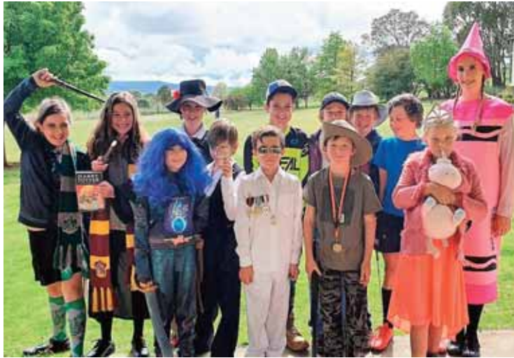
Students enjoyed dressing up as their favourite characters for Bookweek 2020.