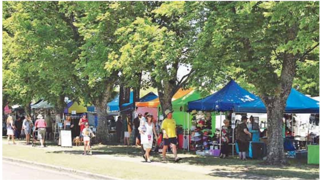
It will be the first time since 1997 that Rotary Park in Guyra will not host a Lamb & Potato Festival

The Guyra CWA Evening Branch will hold an Art exhibition, which will be open