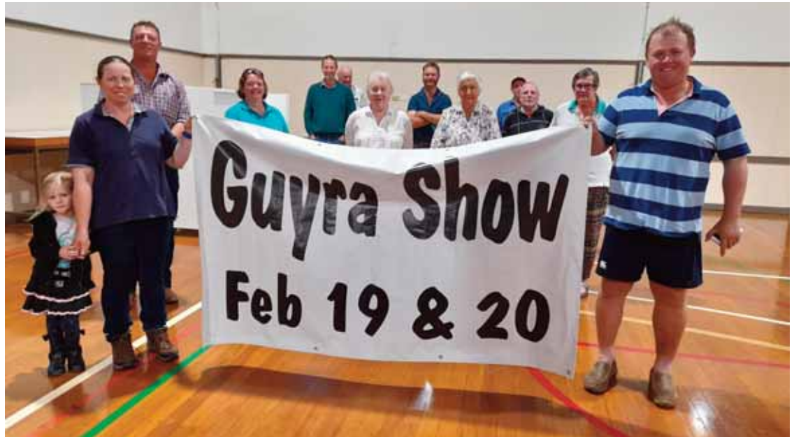
Planning for a COVID safe 2021 Guyra Show is well advanced

At the time of writing all other sections in the pavilion are planning to run as normal. This includes photography, fine arts, fruit and vegetables, and flowers. The popular school arts and crafts section will also run as normal. One of the mainstays of the pavilion, the wool exhibit, is still under consideration but it is very likely it will go