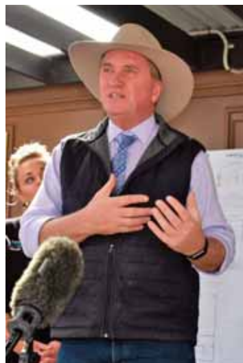
Member for New England, Barnaby Joyce (file photo)

Federal Member for New England, Barnaby Joyce, said