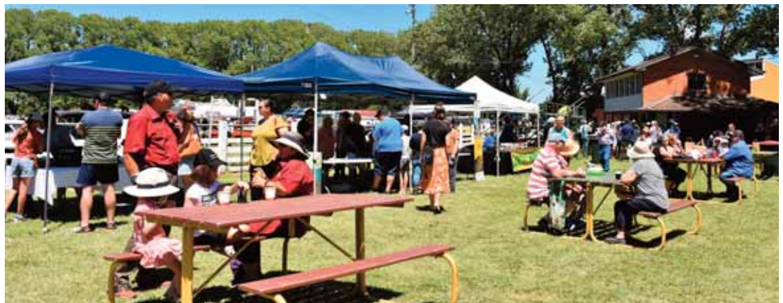
Large crowds came out to support the Lamb and Potato Festival on Saturday

He said the committee are already planning for next year, when everything will be back on the highway for a full 12 day festival