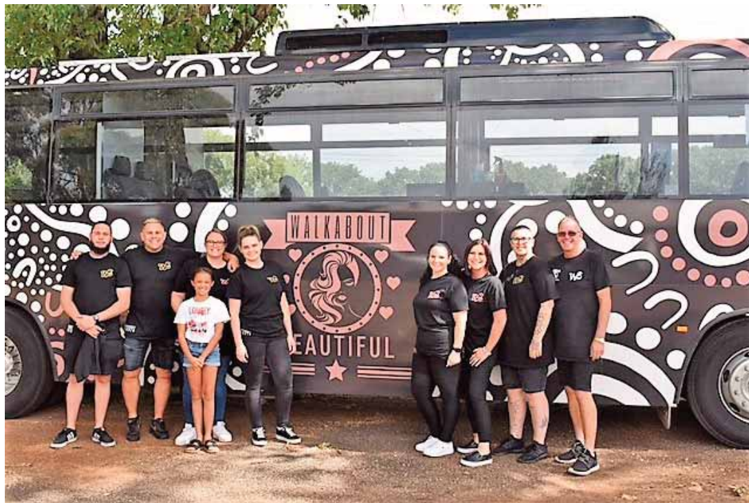
The team from Walkabout Barber Enterprises were kept busy throughout the day providing haircuts and beauty services

Lunch time was busy with all the families lined up for the free sausage sizzle, drinks and icy poles. After lunch we kicked off with the Group 19