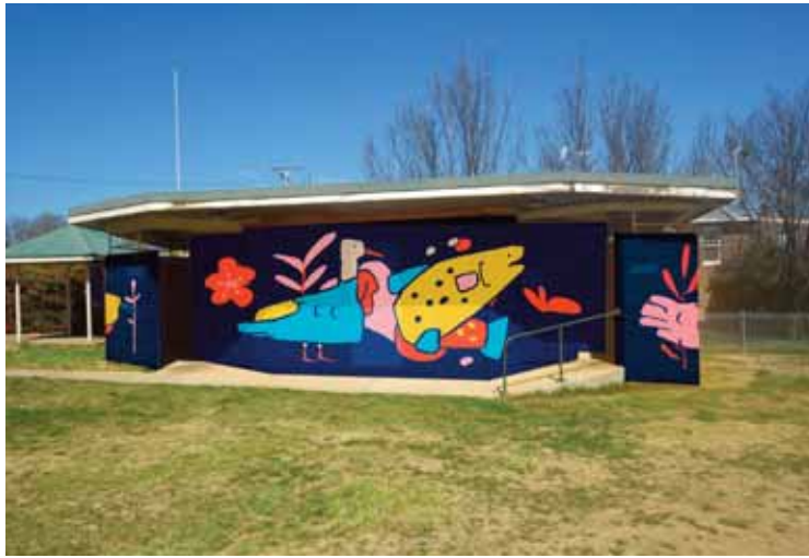
Option 1 received the most votes