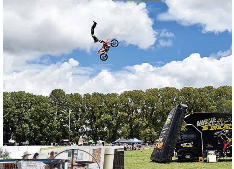
Above: Aussie FMX Motocross put on a spectacular display