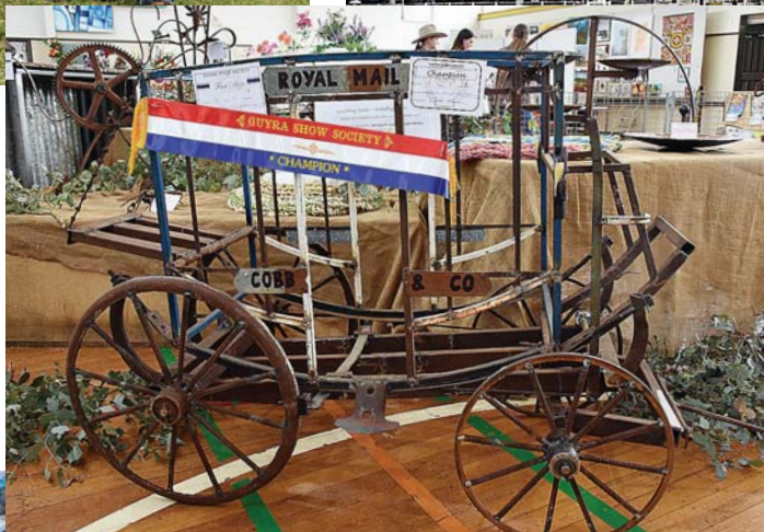
Left: Farm Waste to Art showcased local talent and imagination