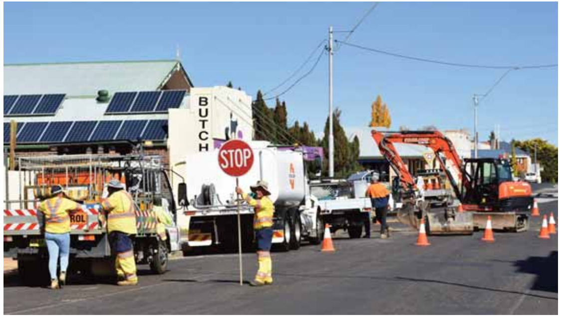
Stage 2 roadworks underway on Tuesday

Progress and future plans for the CBD upgrade have been outlined in a report prepared for the the monthly meeting of Armidale Regional Council which is being held in Guyra on Wednesday, April 28th. As well as providing an update on progress, the Project Management Office (PMO)