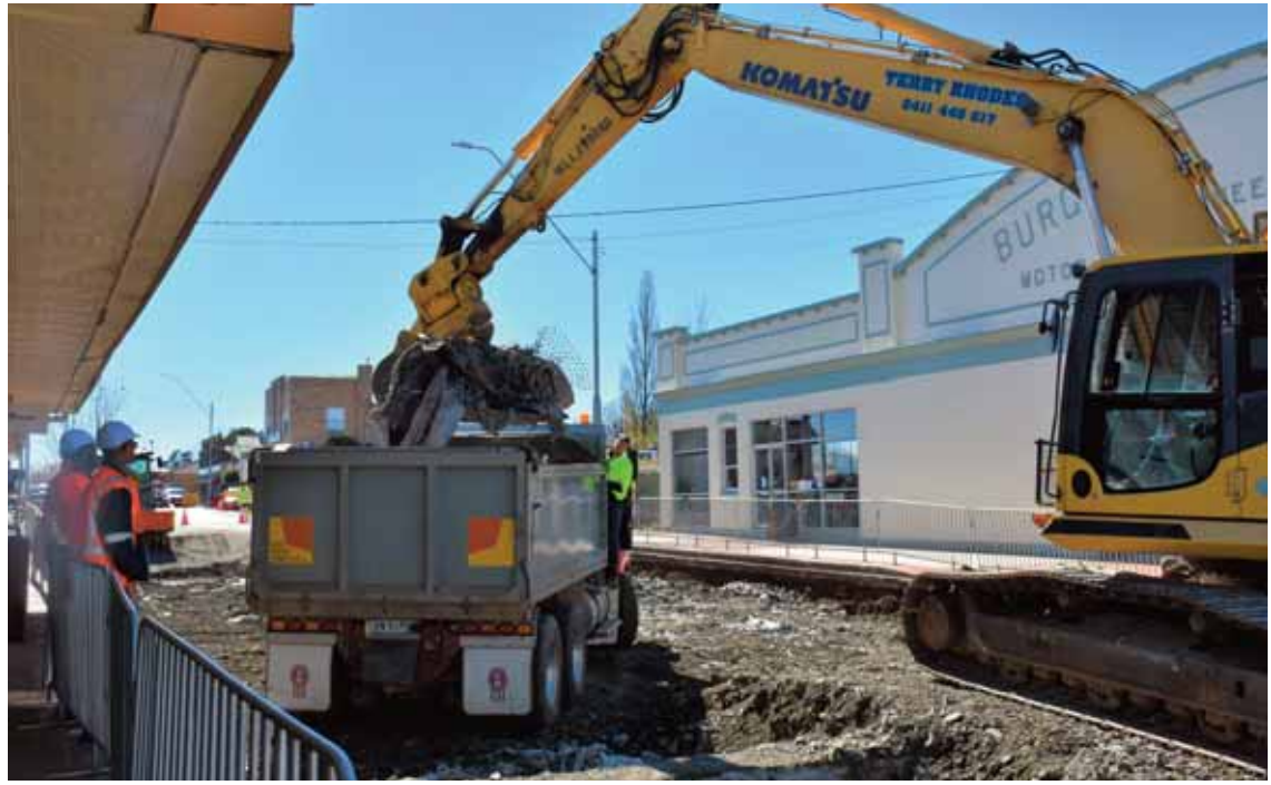
Three weeks after beginning work on Bradley Street, workers have started excavating again

“As expected, excavation works revealed the subgrade was not suitable to construct the new road. Council carried out works to strengthen the foundation, but were not satisfied that it would meet the required standards and the needs of the community.