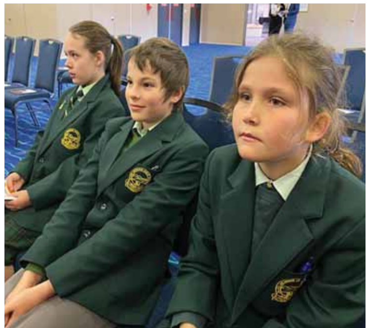
Black Mountain School Leaders