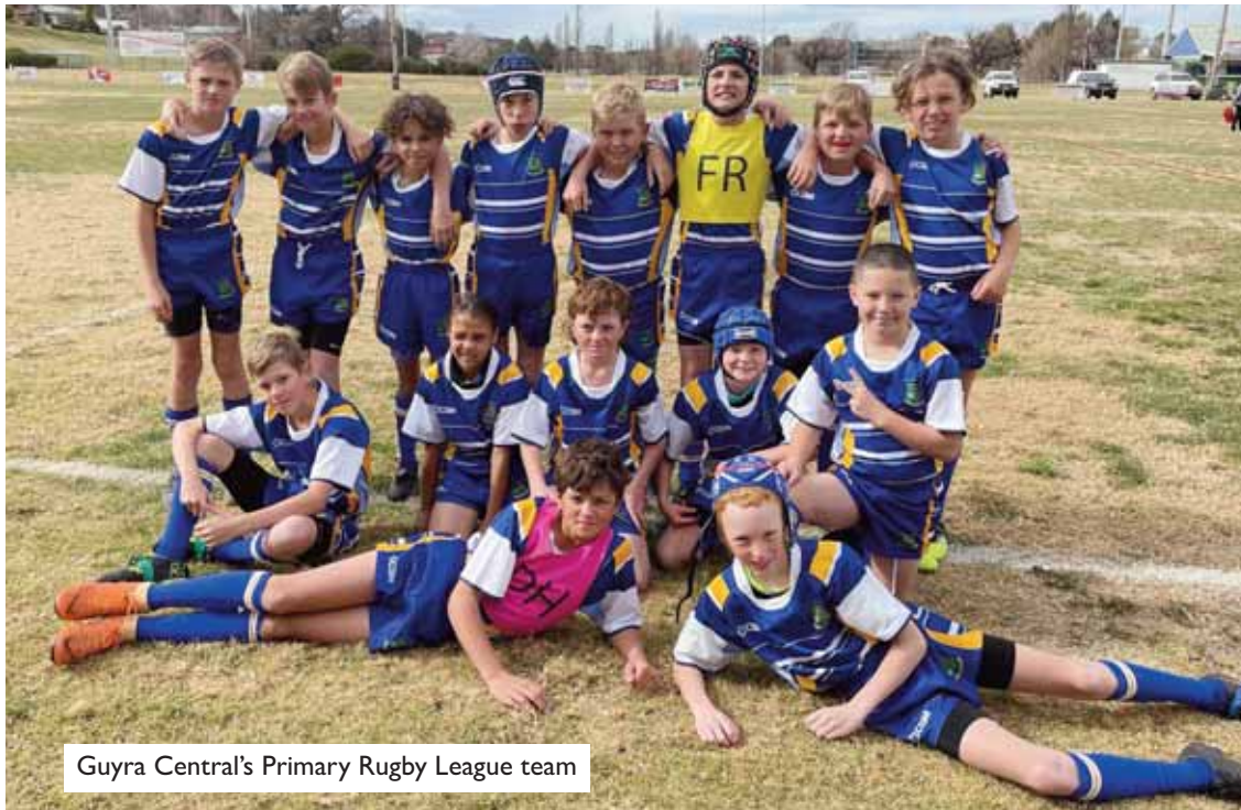
Guyra Central's Primary Rugby League team

On Wednesday the 2nd of June, the Guyra Central School's Primary Rugby League team travelled to Armidale to play against Armidale City Public School. Guyra put points on the board in the first 5 minutes with a try and conversion. They held Armidale out for the most of the first half until Armidale scored right at the end. At half time the score was 20 - 4 to Guyra.