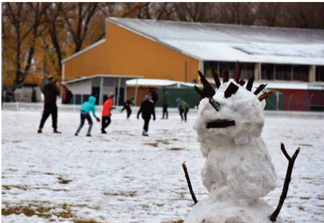
Snow people popped up all over town, including this one at Ted Mulligan Oval See pages 2 and 11 for more snow pics

Thursday saw light snow showers during the day but not settling. Heavier snow arrived in the evening between 9pm and midnight with snow settling to a depth of 8 to 9 cms in town. Rain and higher temperatures in the early hours of the morning