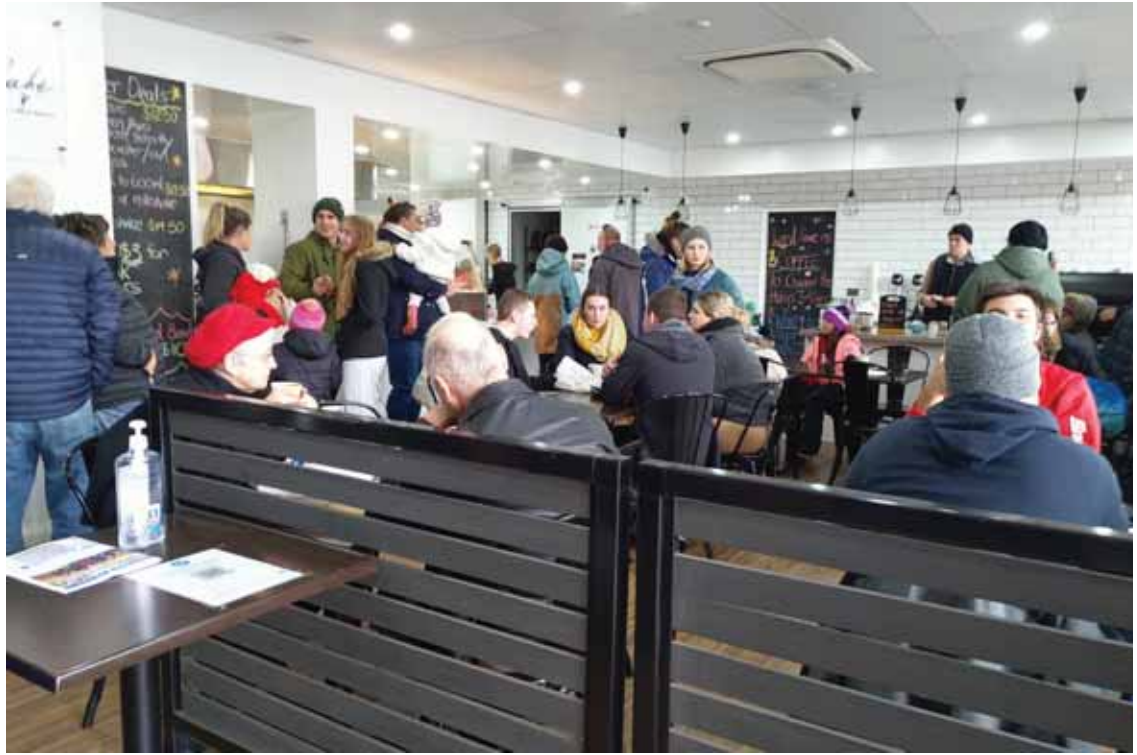
Guyra Cafe was full to the brim with visitors who came to see the snow