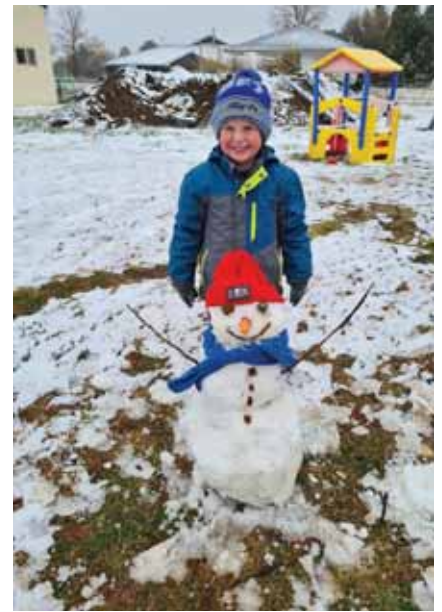
Nathan Lane and friend