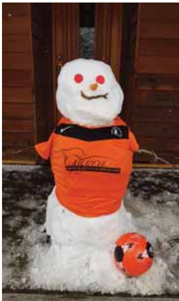
Casper's new mascot built by the Dullaway family