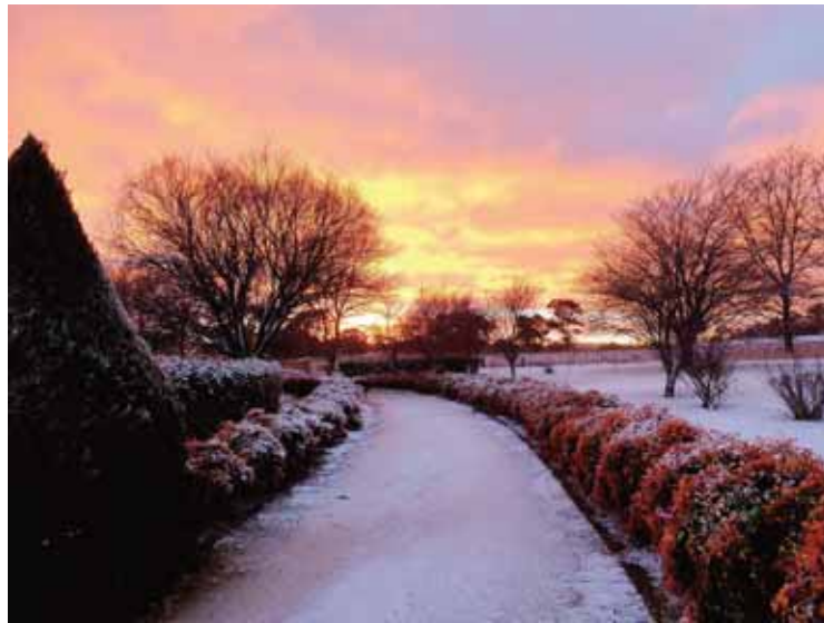
Snowy Sunrise east of Guyra (Michelle McKemey)