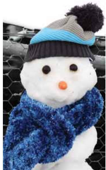
The Saunder's family at Llangothlin celebrated the Blue's win in the State of Origin