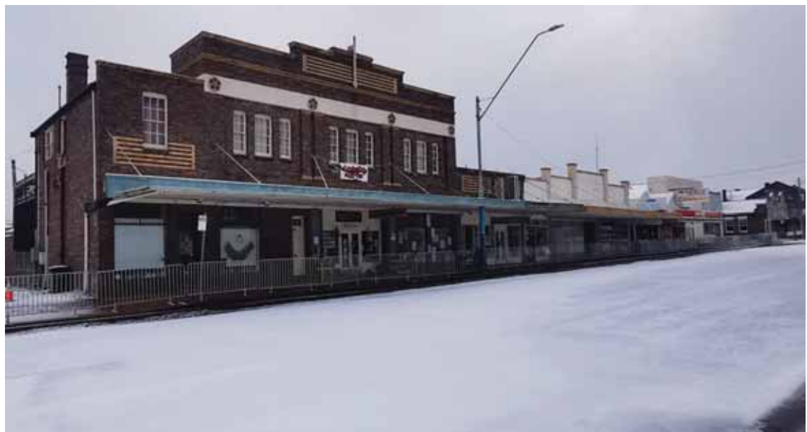
Snowy streetscape (James Warren)