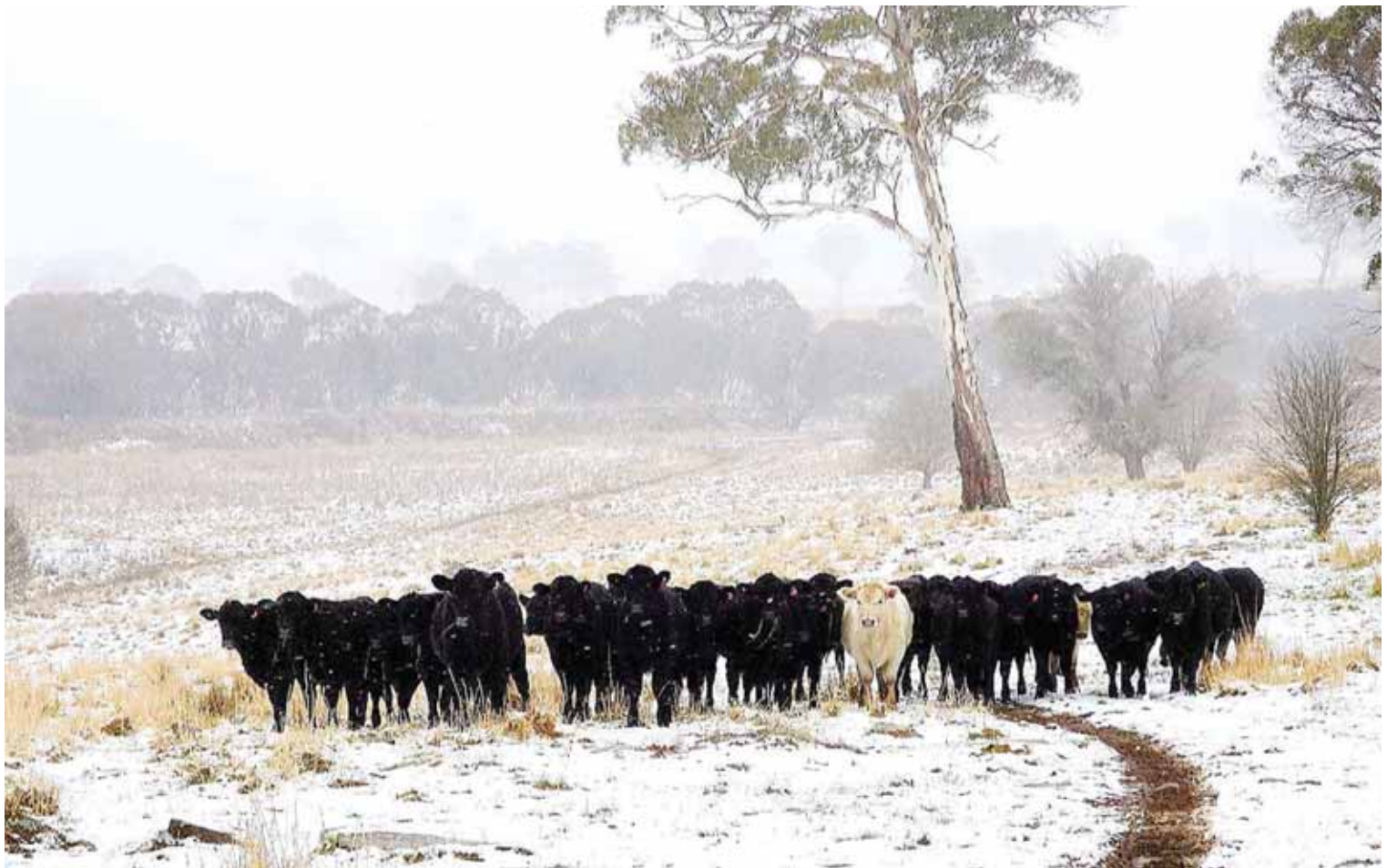
Snow scene at Ben Lomond (Natasha Saunders)