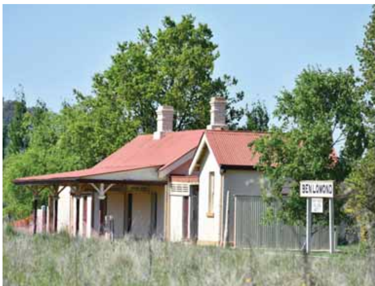
Ben Lomond Railway station is set to become a launch pad for cyclists with funding announced to construct Stage One of the NE Rail Trail

"The rail trail will revitalise this asset and generate economic growth through increased tourism, providing a