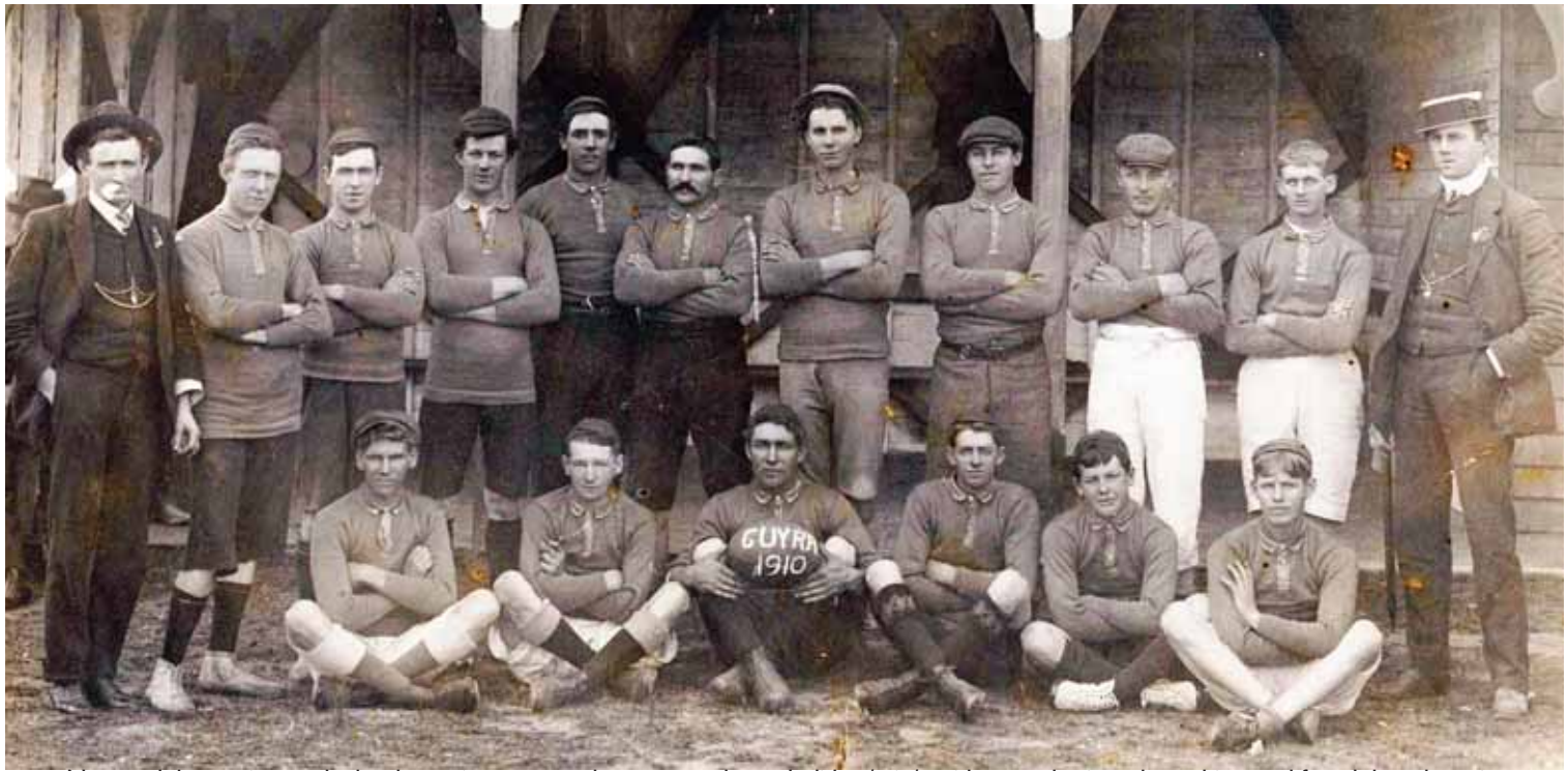
Not much happening on the local sporting scene at the moment due to holidays/rain/covid so we dug into the archives and found these beauties. Both are rugby league teams circa 1910 (above) and 1940/50s (below). Fashions have certainly changed! Have fun seeing if you can spot a familiar face or two. (Check out the girls inside)