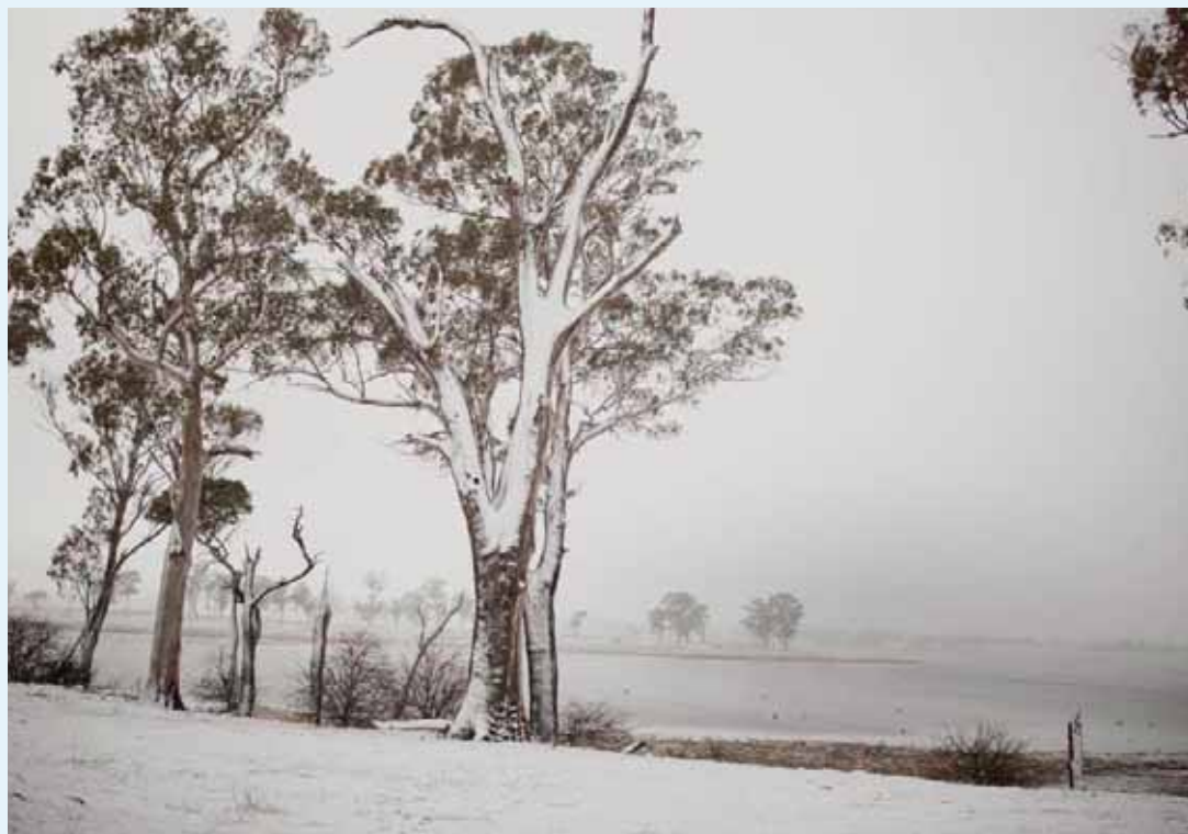
PIC OF THE WEEK: Mother Of Ducks Lagoon snow scene July 21st, 2021