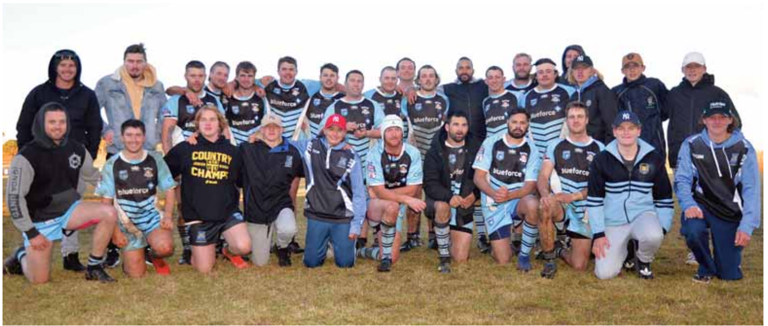
The Super Spuds with some of the Guyra Under 15s players after Saturday's games.

Guyra hosted a huge day of football on Saturday and topped it off with a win in the A grade clash with old rivals Armidale.