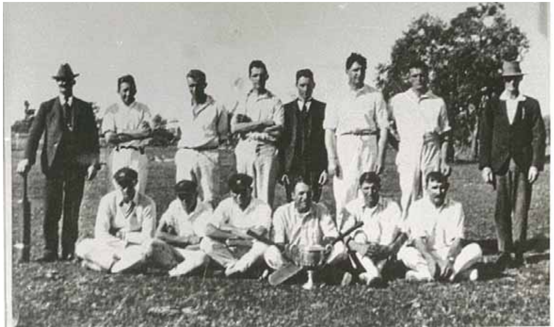
Black Mountain Cricket team 1928