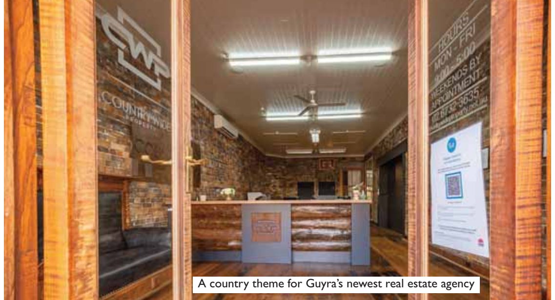
A country theme for Guyra's newest real estate agency

fering all real estate services and are looking forward to providing the same service in Guyra that has proved successful in Glen Innes.