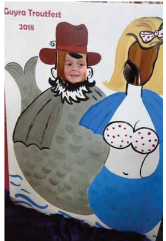
Kids activities will be front and centre at TroutFest in 2021

On Sunday children only can go fishing in Guyra's very own trout dam at the Golf Course. Four tagged fish will be released into the dam to catch for cash prizes. Photographic proof is required.