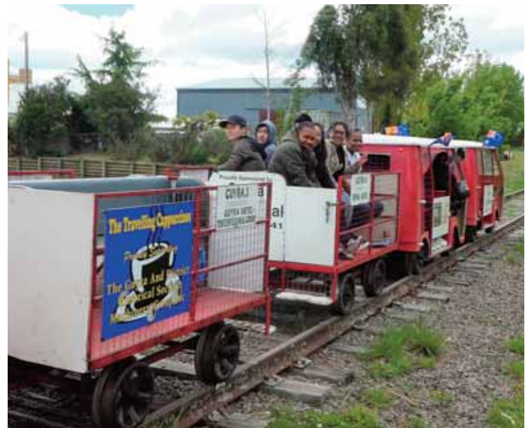
Train rides were a hit with visitors despite the icy winds