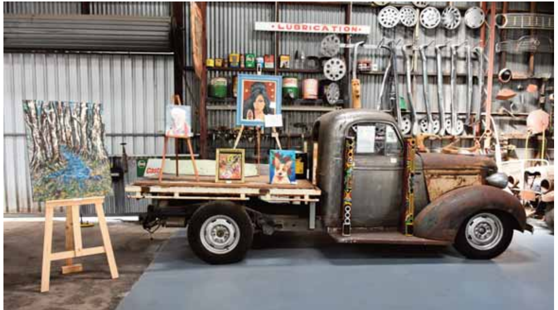
Art amongst the vintage cars proved popular

“There was many an excited child who caught a trout on the day and on Sunday the enthusiasm continued with many