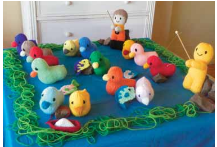
Retailers really got creative with their windows and decorations this year. This is the WoolShop's cute contribution