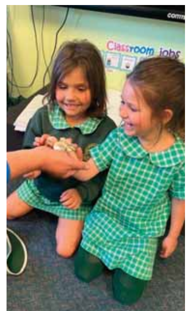
Students enjoyed counting the birds in the school's playground