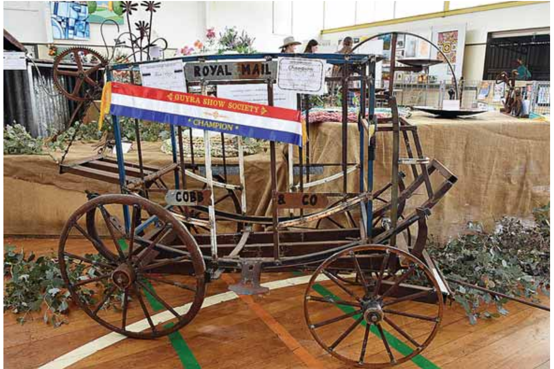
Have you started your project for the Farm Waste to Art competition?

There will be plenty of action around the grounds over the two day including the Poultry section that was well supported last year and the Caged