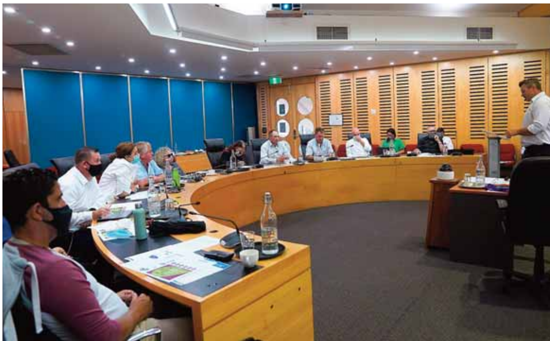
The newly elected Armidale Regional Council will elect a new Mayor this week

"This was the first opportunity our new council has had to