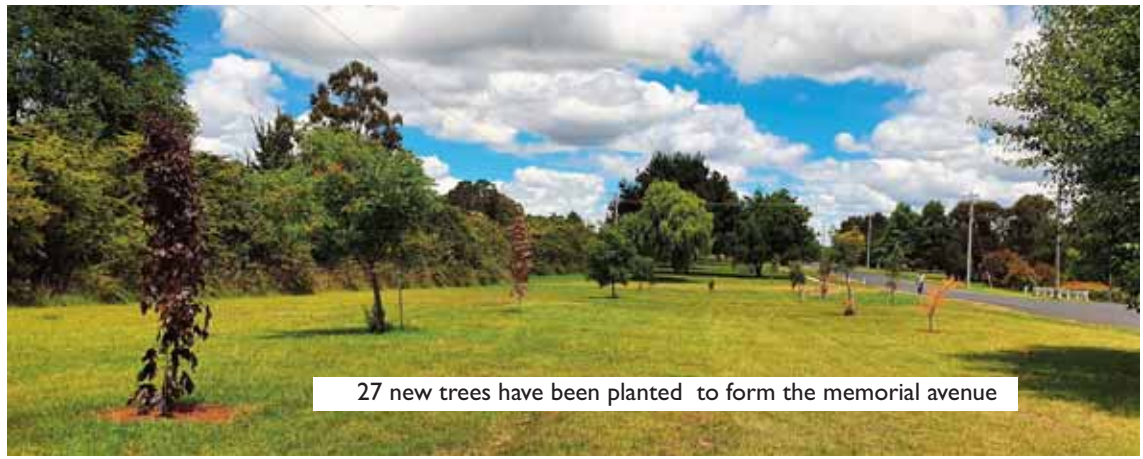
27 new trees have been planted to form the memorial avenue