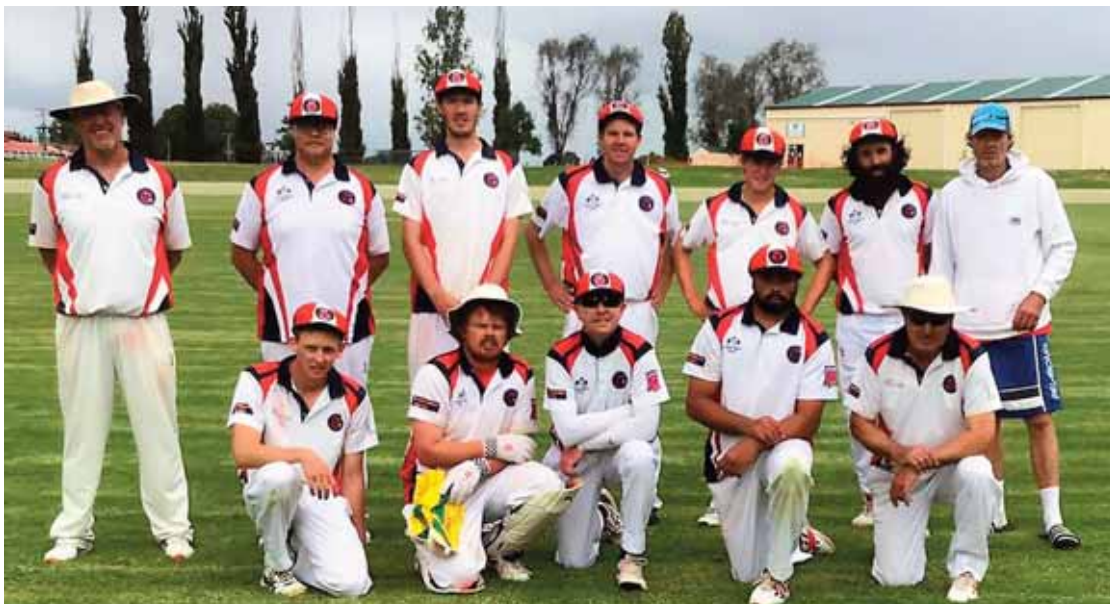
Guyra 1st Grade

Guyra batted first, finishing with a competitive total of 7/90. In reply CSC Easts (3/103) were the better team on the day.