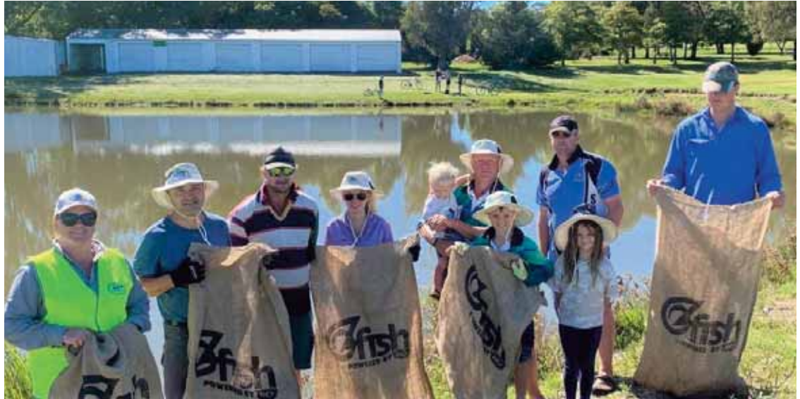
Guyra Anglers Club Members supporting OzFish Wasted Waterways Cleanup at Tenth Dam and Mother of Ducks Nature Reserve on the weekend

Sunday March 20th saw the Guyra Anglers Club members undertake the OzFish Northern Tablelands Chapter Wasted Waterways cleanup day at the tenth dam and Mother of Ducks Nature Reserve. With a small group undertaking the task, we are thankful for their efforts and for volunteering their time. We removed plastic and glass bottles, food packets, and many