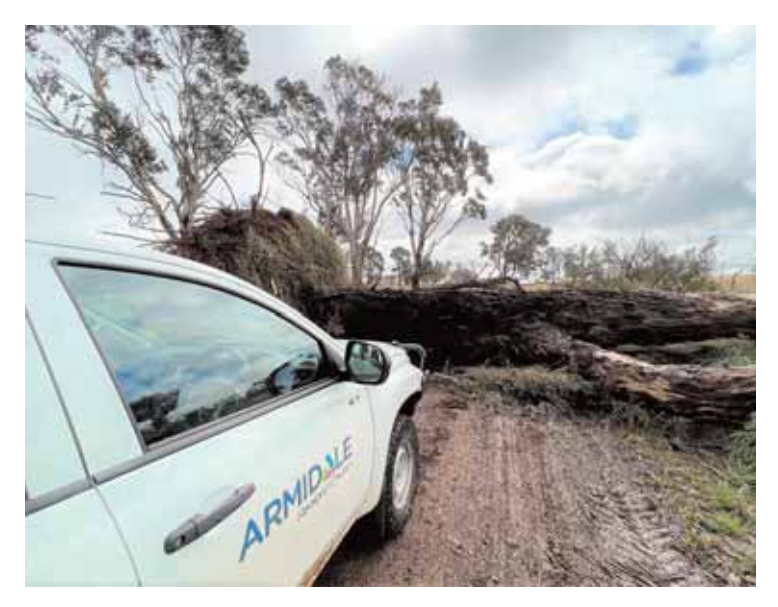
Glen Ross Rd was one of many that were blocked by fallen trees

By midday on Tuesday, more than 123 calls for assistance had been logged with SES units across New England. More than half of all calls received across