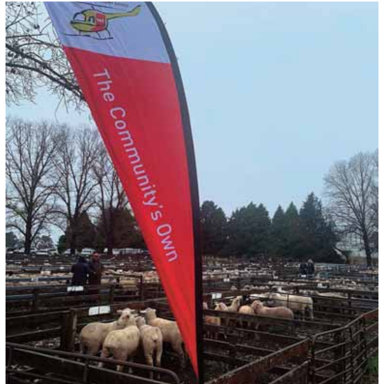
The donated lambs were auctioned at last week's Guyra sheep sale

There is still an opportunity to support this great cause, with an auction of donated items being held at the Royal Hotel on Friday July 15th starting at 7pm. They will also be drawing the winner of the wood raffle on the