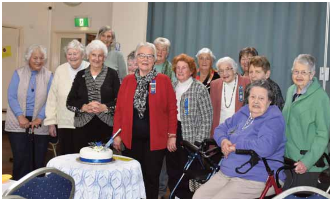
Above l to r:

The first objective was to raise sufficient funds to purchase land on which to build a restroom, an amenity where country mothers with young children could go to feed and change their babies and make a cuppa. In these times money