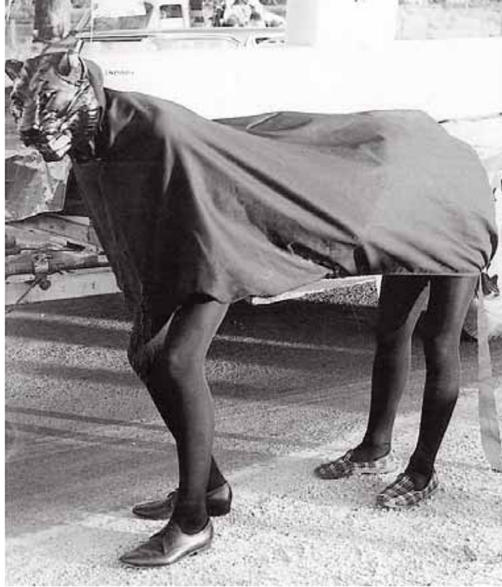
The Black Panther at Rotary's Christmas Parade

black panther! In the 1970s and 80s there were many sightings of a black panther prowling the local roads and by-ways.