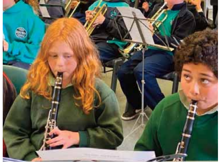
Black Mountain students enjoyed learning new music skills last week