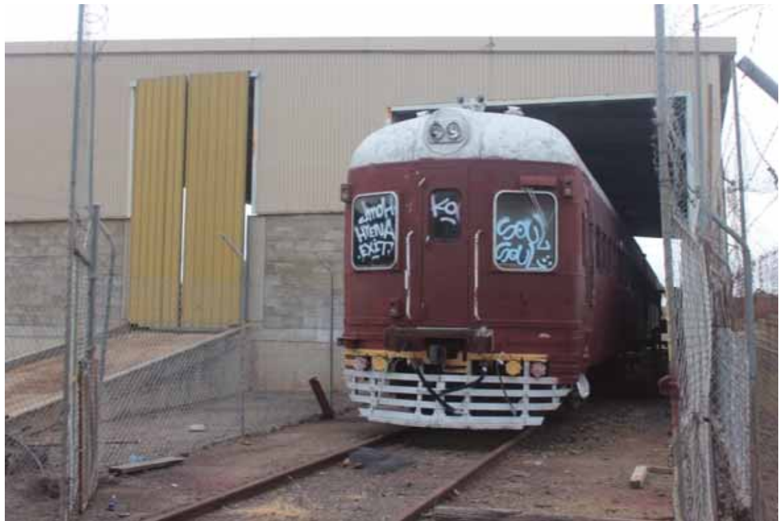
New England Railway Inc. (NERI) are working to restore trains which are currently housed in Armidale and they hope to see them running again

Business planning has been undertaken by the new board with plans now underway to send one of the trains to Lithgow Workshops for a full restoration. Whilst some of the work is beyond local expertise, NERI would like to support local businesses as much as possible so