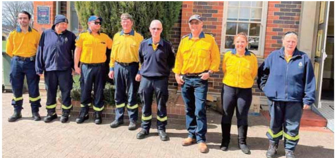
Guyra RFS members at the presentaion of medals

Many personnel went on to be dispatched to assist with the firefighting efforts across the state, as