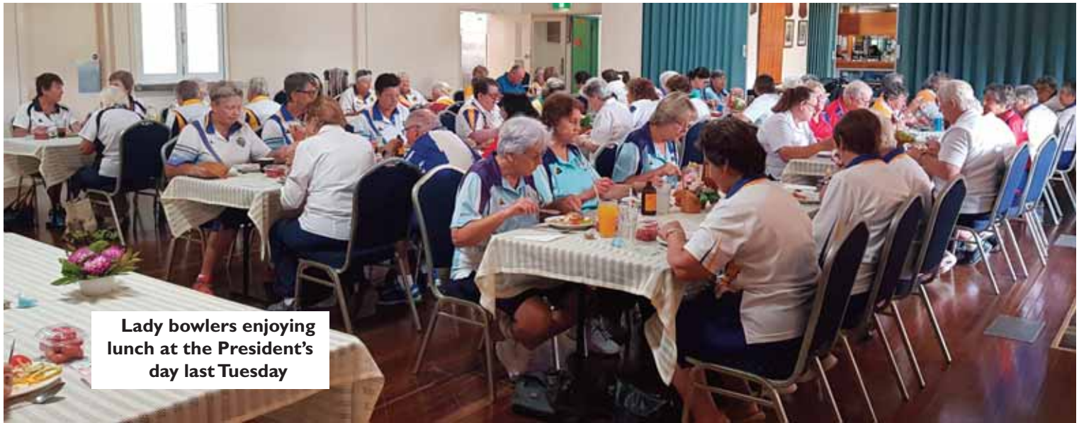
Lady bowlers enjoying lunch at the President's day last Tuesday