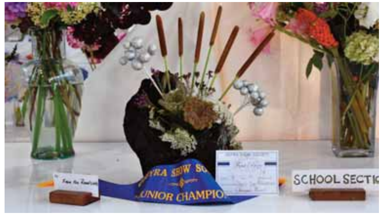
Clockwise from left: Champion Decorative, School age Champion and Champion Rose exhibits