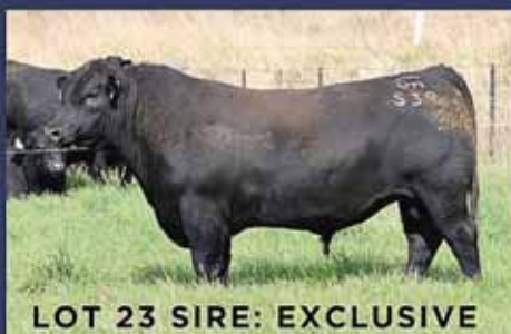
LOT 23 SIRE: EXCLUSIVE

BULL SALE FRIDAY 12TH MAY 12PM ON AUCTIONSPLUS ONLY