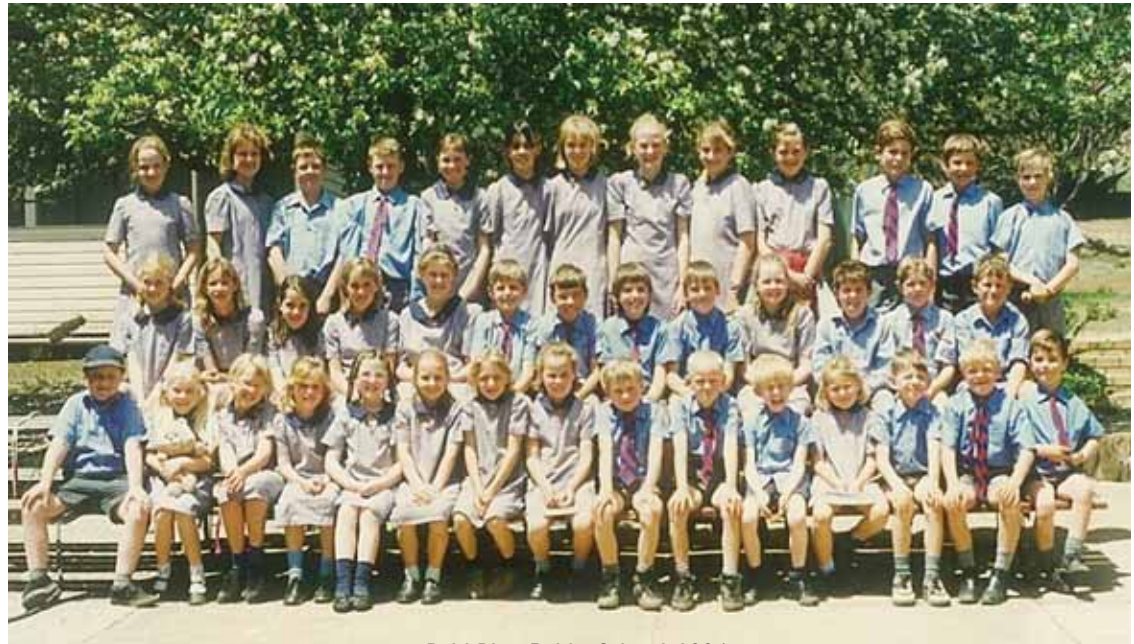
Bald Blair Public School, 1994