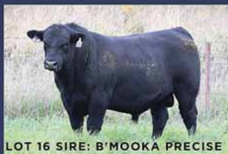
LOT 16 SIRE: B'MOOKA PRECISE

OPEN DAY @ "WATTLETOP" GUYRA WEDNESDAY 10TH MAY 11AM-3PM