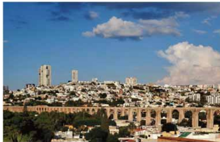
The Querétaro arches, originally built as an aqueduct.

We have also had two to three Rotary dinners during the month which were all enjoyable. Because we have had new students arrive I have found them more enjoyable, rather than being the only exchange