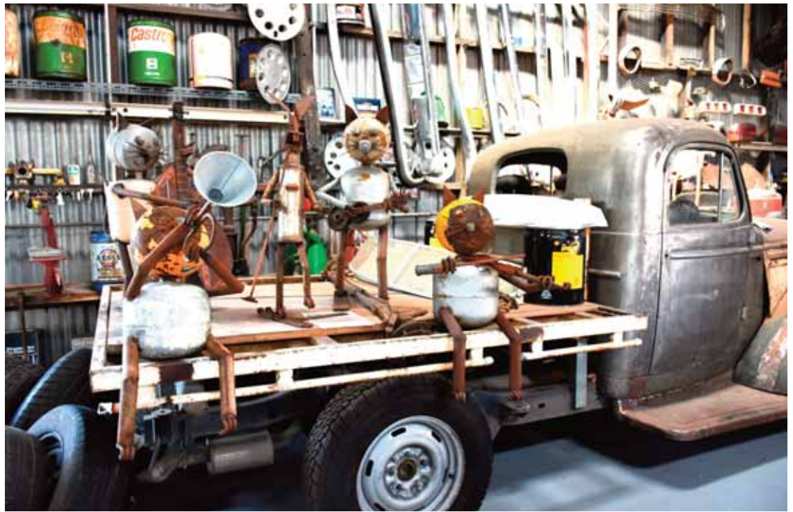
The Cool Cats Band on display in Burgess Garage Car Museum during TroutFest

The committee would like to thank all the businesses that were open as they wanted to bring life to the street to showcase what Guyra has to offer. Thank you to the service clubs and volunteers who assisted - we know it can be tough as numbers are minimal in some clubs.