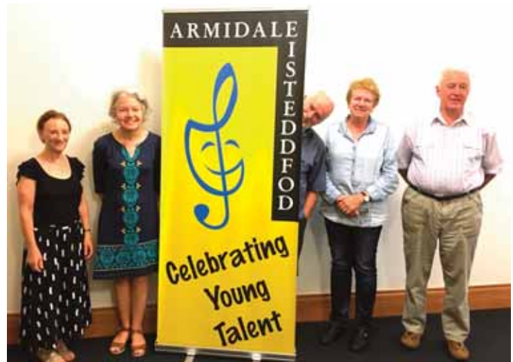
Armidale Eisteddfod committee members with banner

Choir Night and Band Night are always popular events and this year will be held on Wednesday, May 22nd (Lazenby Hall) and Tuesday, June 4th (Old Teachers' College