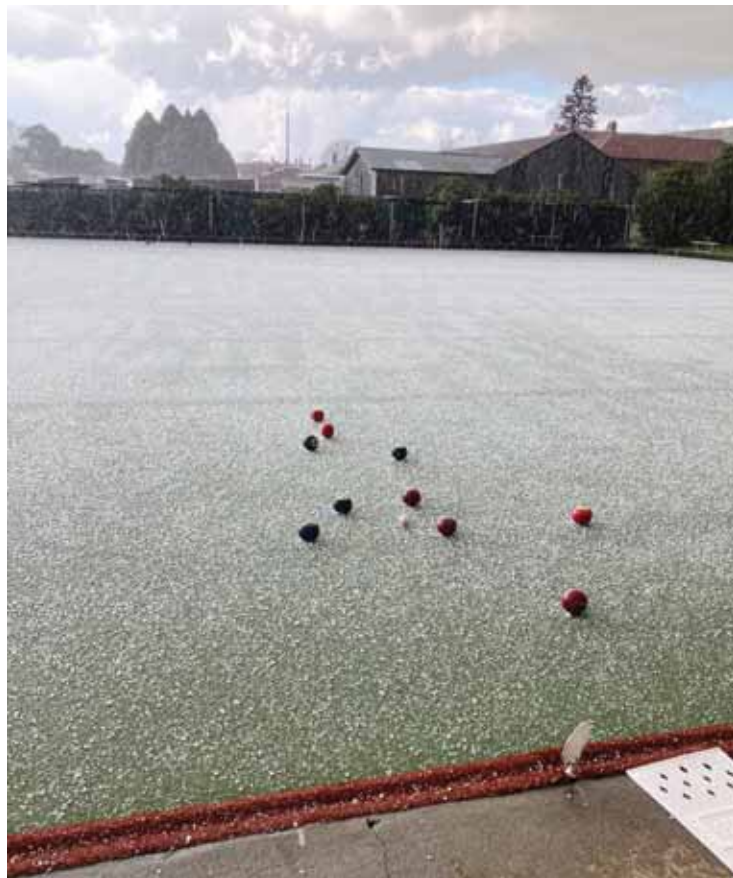
Play was suspended on Saturday due to hail and snow

This week is a Golf NSW Medal Round. Also, the Mabel McKenzie Brooch.