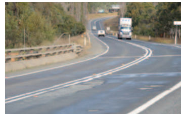
Roads across the region have seen an increase in traffic due to flooding on the coast.

"The cost of the damage has met the $240,000 threshold of expenses which wouldn't normally occur in