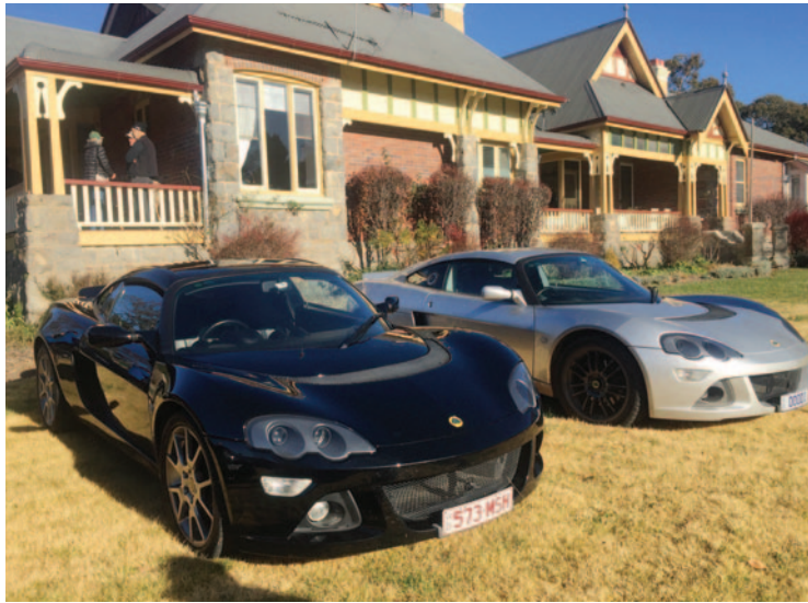
A convoy of exotic and historic sports cars will roll into Guyra on Saturday July 5th, stopping outside the Burgess Garage Car Museum

"The Grand Tour is our premier event that embodies the essence of what we stand for – touring regional areas, support-