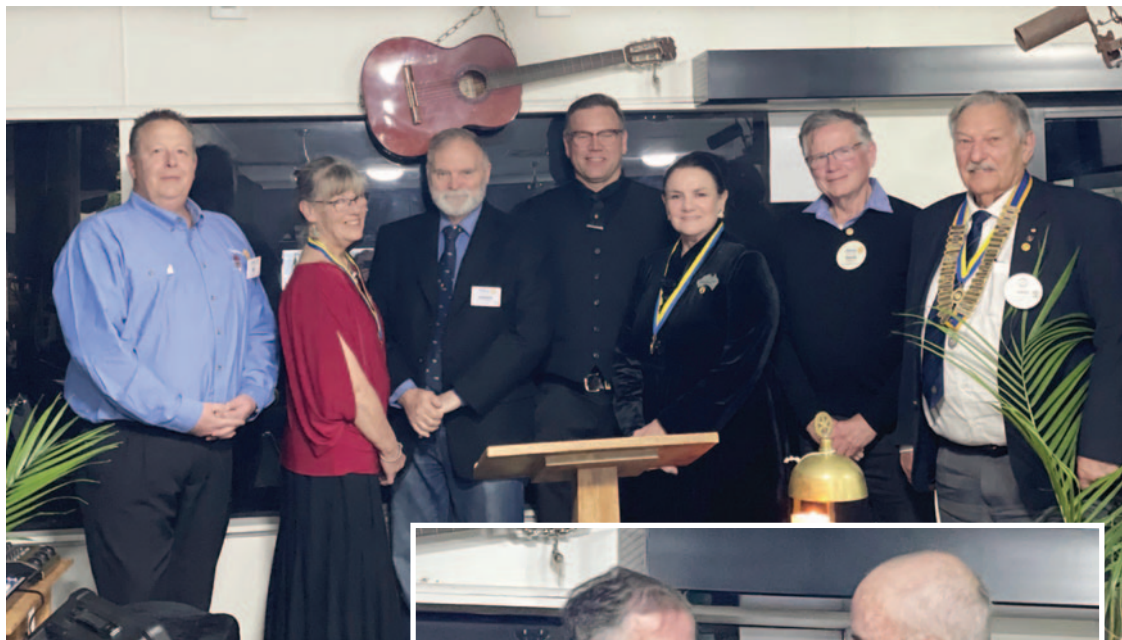
Above l to r