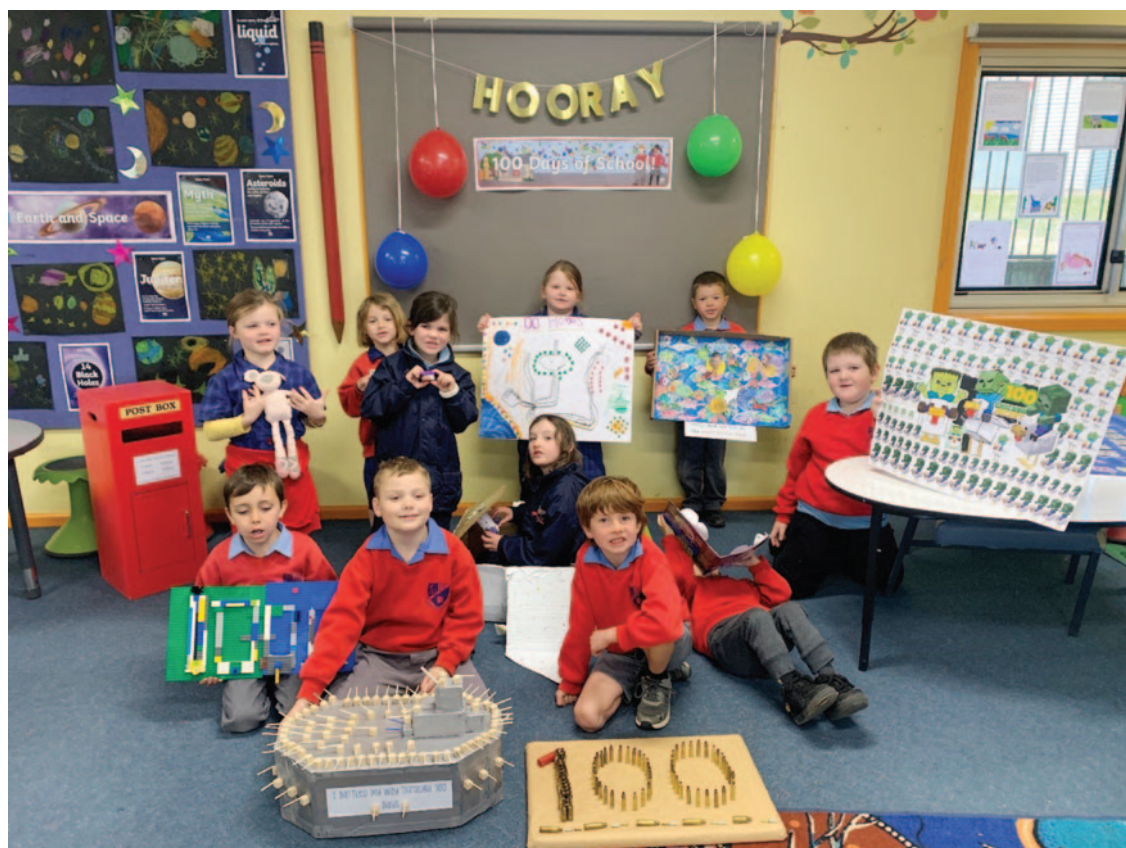
Bald Blair Students in K-2 Celebrated 100 Days of Learning