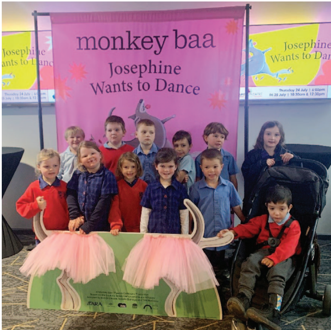
Kindergarten – Year 2 Students at Josephine Wants to Dance