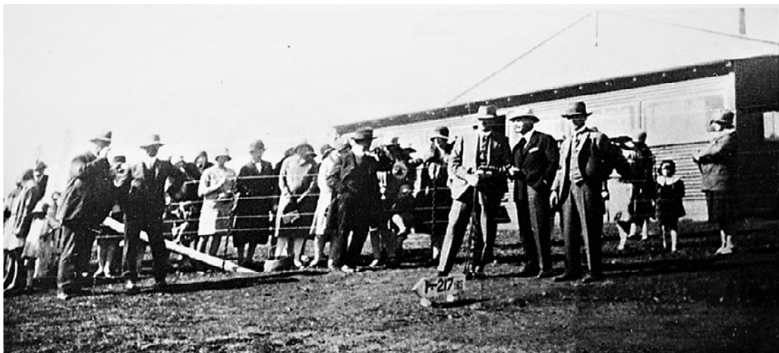
The opening of the Guyra Golf Club by Lord Stonehaven (Governor General) 1928

There will be a display of golfing memorabilia which has been gathered and arranged by a team of dedicated volunteers. It includes historic photographs, news articles, trophies, uniforms, old clubs and scorecards.