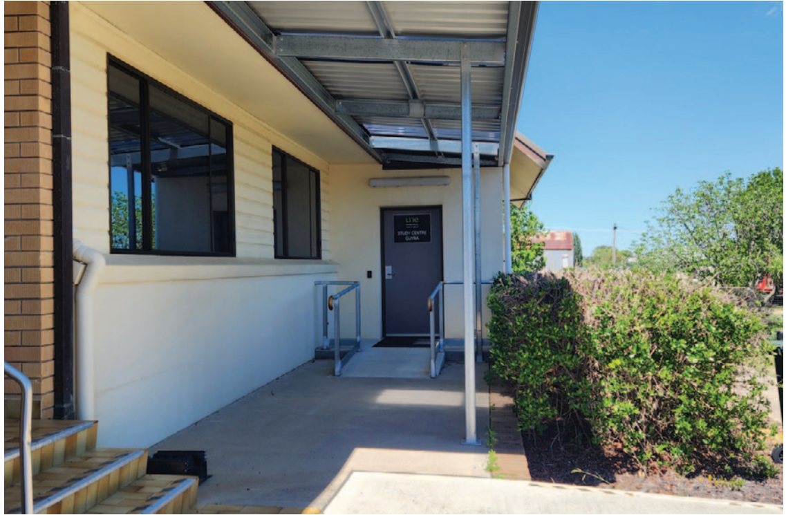
HSC Exams are being held in the UNE Study centre behind the council chambers

The HSC marks the culmination of 13 years of schooling for these young people, and the exams represent the final