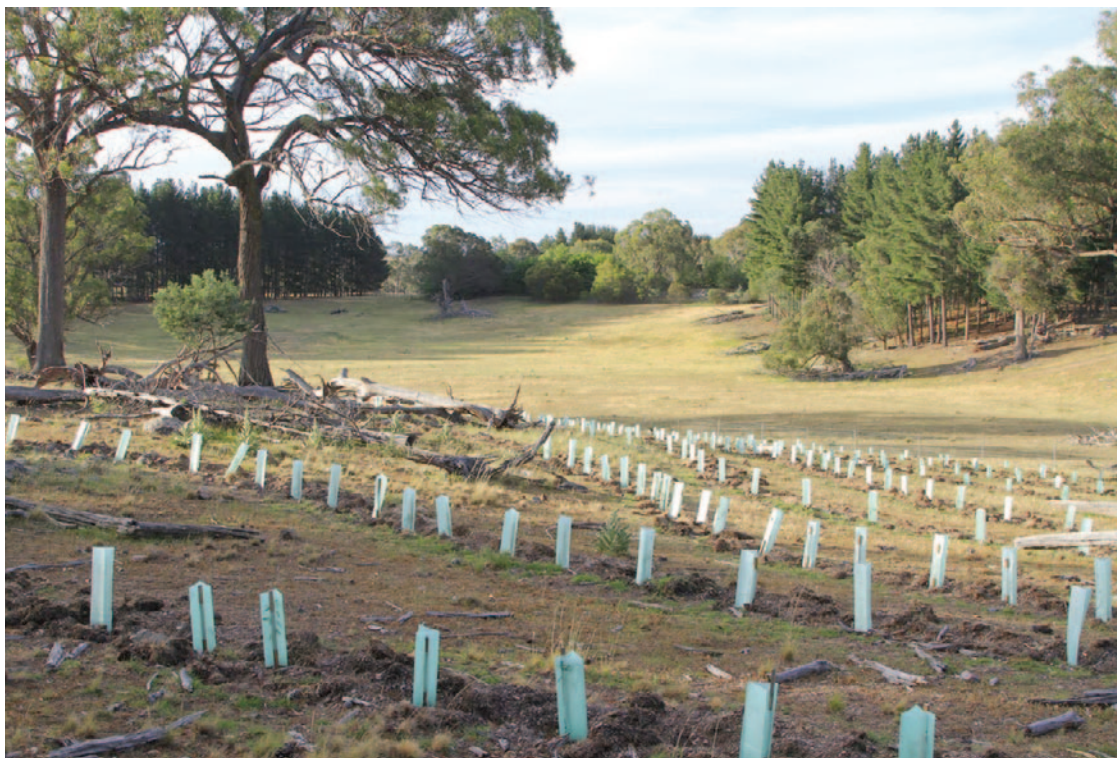
Speakers will cover practical topics such as carbon income, biodiversity credits, renewable energy lease deals

Attendees will also hear about local research from UNE and CSIRO's Chiswick farm, as well as insights from a local grazier taking