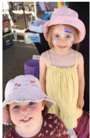
There was a lineup for the ever popular face painting