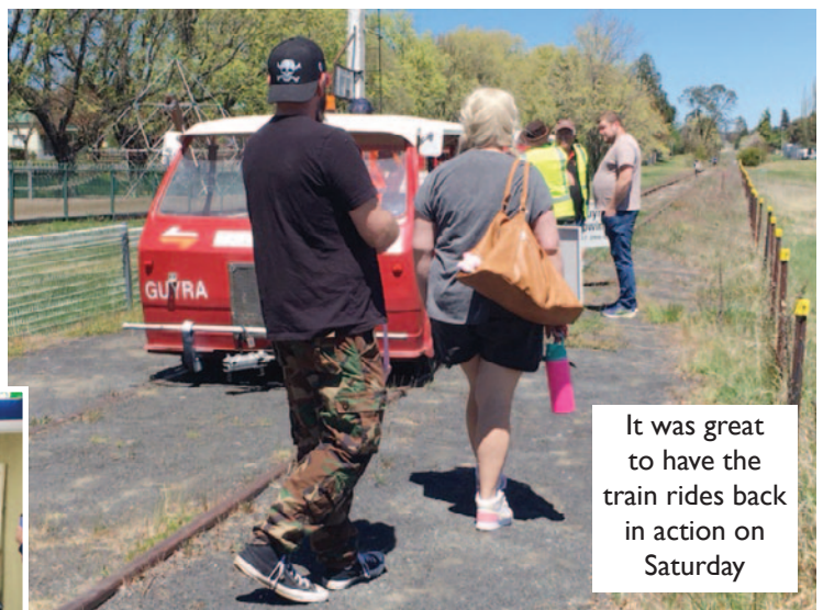
It was great to have the train rides back in action on Saturday