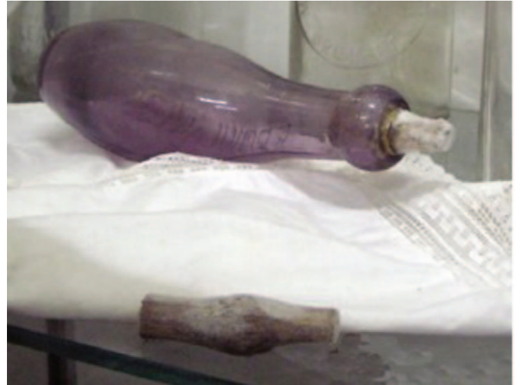
Old feeding bottle on display at the Guyra Museum