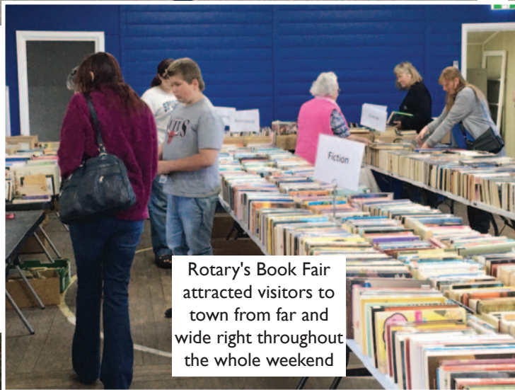
Rotary's Book Fair attracted visitors to town from far and wide right throughout the whole weekend