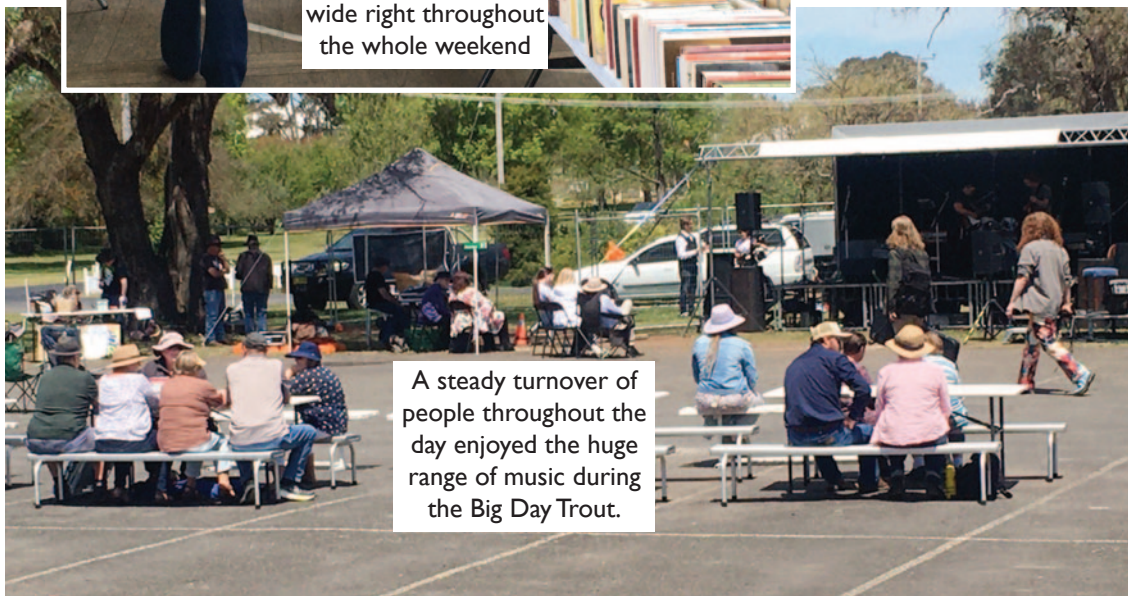
A steady turnover of people throughout the day enjoyed the huge range of music during the Big Day Trout.