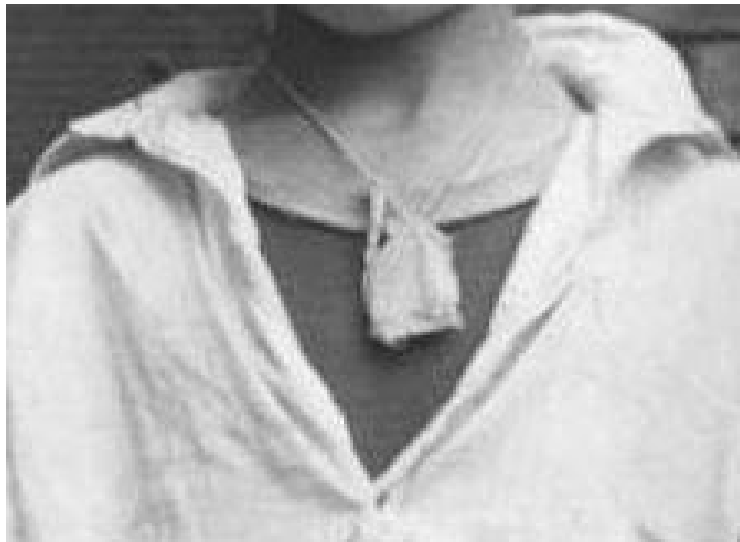
Camphor bags were worn around the neck top ward off colds and flu

Mustard poultices were applied for various infections. Venus Turpentine was guaranteed to remove not only splinters from humans but also stakes from Horse's hooves and legs.